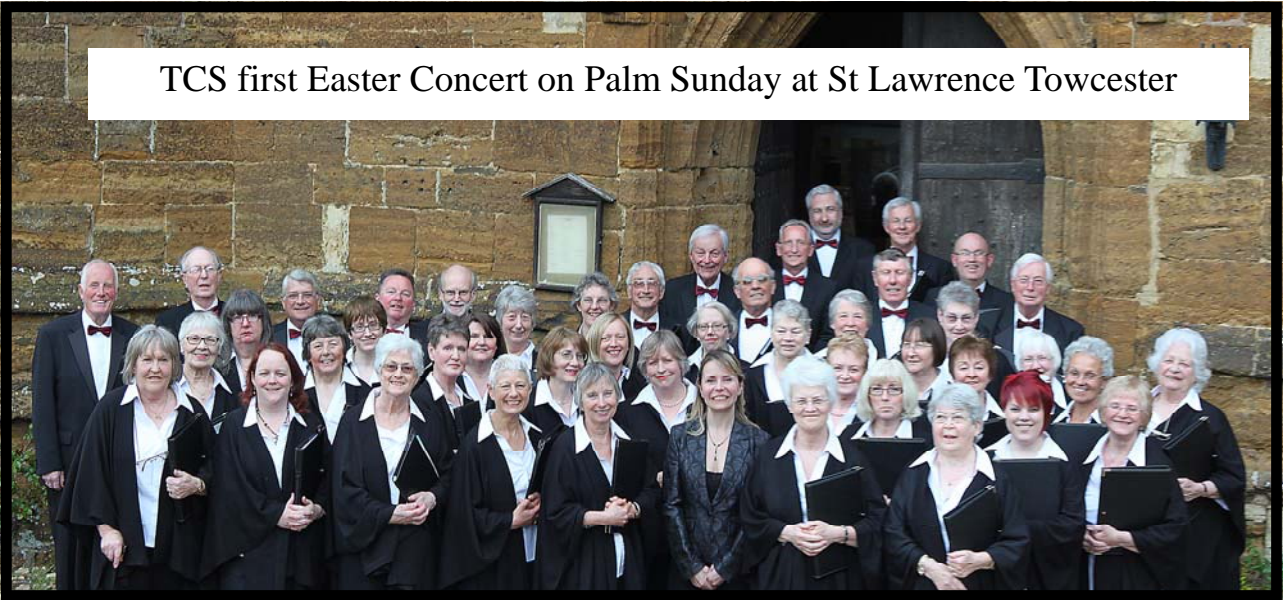
TCS first Easter Concert on Palm Sunday at St Lawrence Towcester