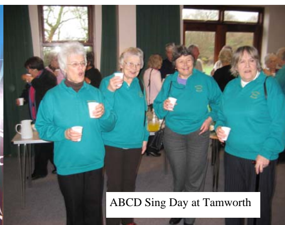
ABCD Sing Day at Tamworth